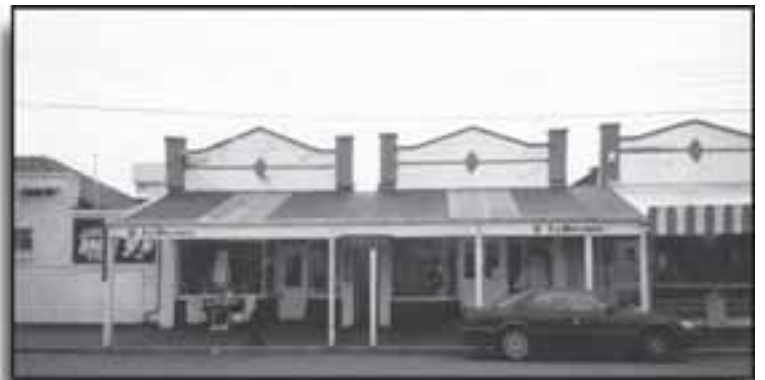
The site of the future café/bar on Westminster St

The second concern relates to anti-social