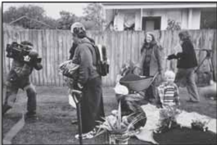
Ribbon-cutting at the opening of the Gardening Project

A great afternoon was had by all who were present at the ribbon-cutting and start of work on the community garden, being established in the car park at the Edgeware pool site.