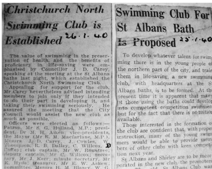
Newspaper articles from 1940

It was not until August 1949, that the newspaper reported, "An enthusiastic meeting was held in St Matthews school room for the purpose of reforming the Swim club." "It was a case where children just had their swim, or bathe with no one to coach or teach them to swim." After