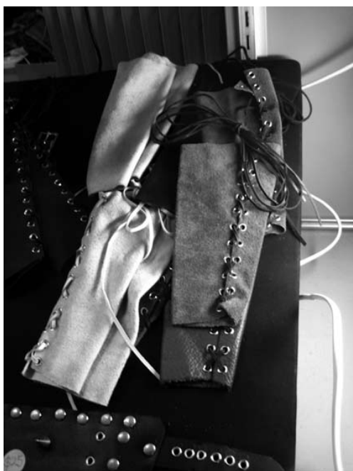
Suede gauntlets at Alternative Essentials