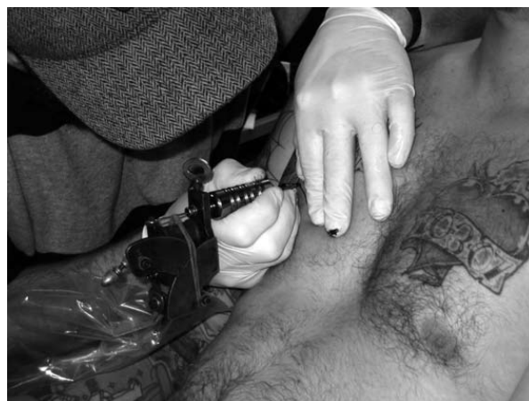
Art at Ink Grave