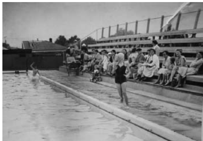
Victory Memorial school swim lessons at the pool in the 1950's using the newly built grand stand.