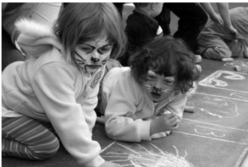
A lot of fun for the younger generation, too!

The Cranford Centre holds a café every Saturday morning to serve the English Park market. A very successful quiz night was held recently, and in the New Year a pre-school music group, Musical Tots, is beginning. Courses and classes on parenting and marriage will be running soon, and the Centre looks to be a hive of activity for the community.