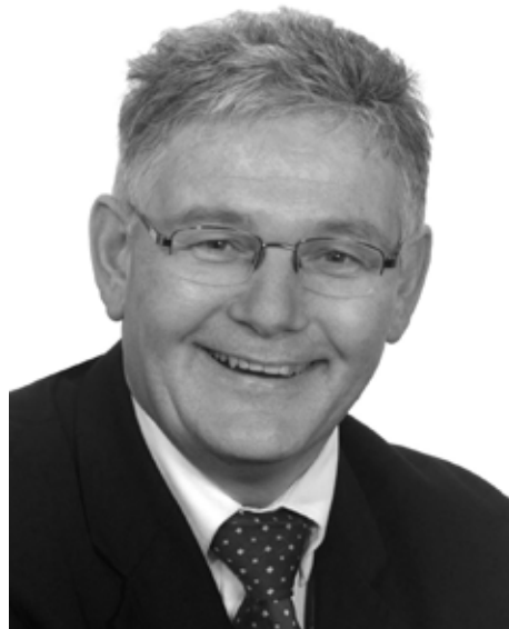
Brendon Burns MP, Labour

What does all this mean for St Albans residents? I approached both Brendon and Nicky and asked for comment on what effect the election result will have,