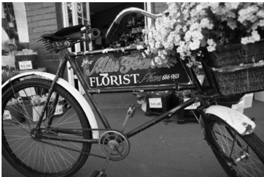
Miss Feaver's Flowershop